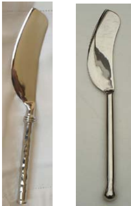
13119P 11119P Cake Knife