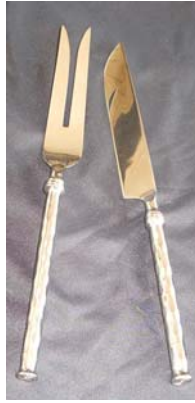
Code: 13117P & 13118P Beleza Carving Fork and Knife