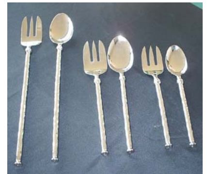
Code: 13115-16LP Long 13115-16P Medium 13115-15SP Small Beleza Servers