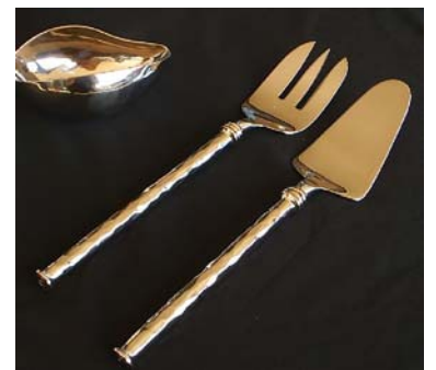
13116P & 13120P Serving Fork & Serving Slice