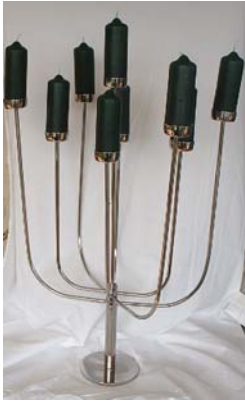
Code: 20208 Candelabra - orders only