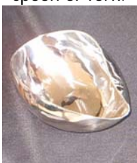
Code: 2005205 Pouring Jug