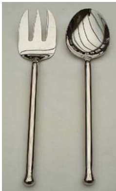
Code: 11115-16 Milano Medium Servers.