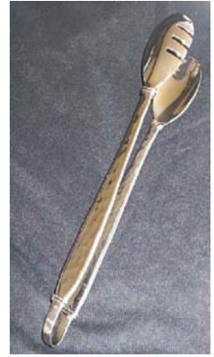
Code: 20114D Salad Tongs