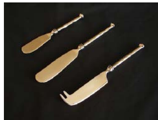
Code: 13108P (2 sizes) 13109P (cheese) Butter/Pate and Cheese Knives Also in Milano style Code: 1108P Butter/Pate 1109P Cheese

Can also be purchased as separate spoon or fork.