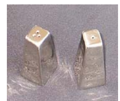
20034 Salt & Pepper 2.5 x 6cm